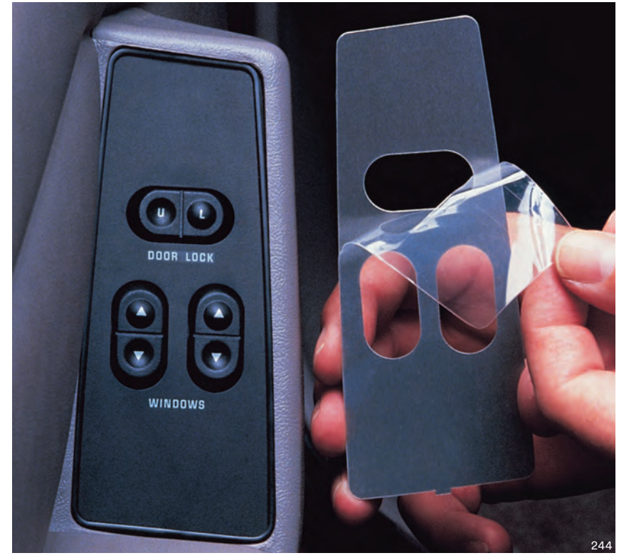
With high cohesive strength, 3M™ Adhesive 200MP bonds aggressively with excellent temperature resistance. Meets the non-fogging specifications of the automotive industry.